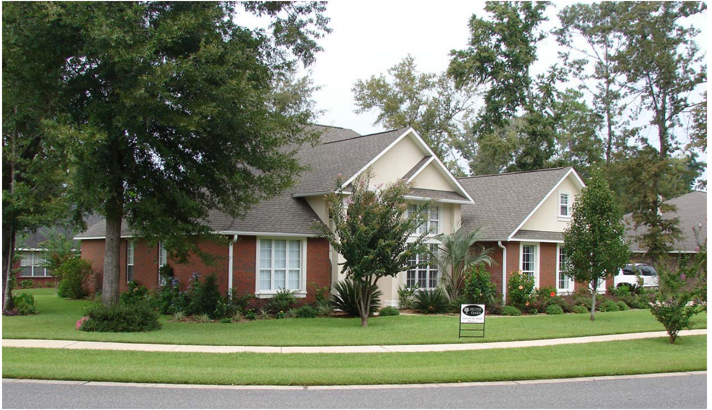
September 2006 Yard of The Month, The Miller's, 5840 Saratoga Drive