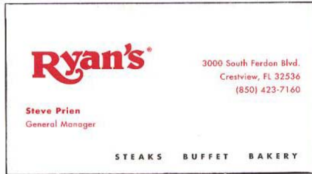
Ryan's Mission Statement

Thanks again to Ryan's for their support concerning our Yard of The Month winners. Give them a chance to earn your business. You won't leave hungry.