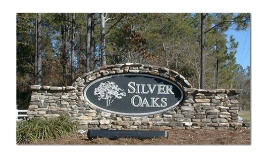
Silver Oaks Phase I Newsletter Editor P.O. Box 1542