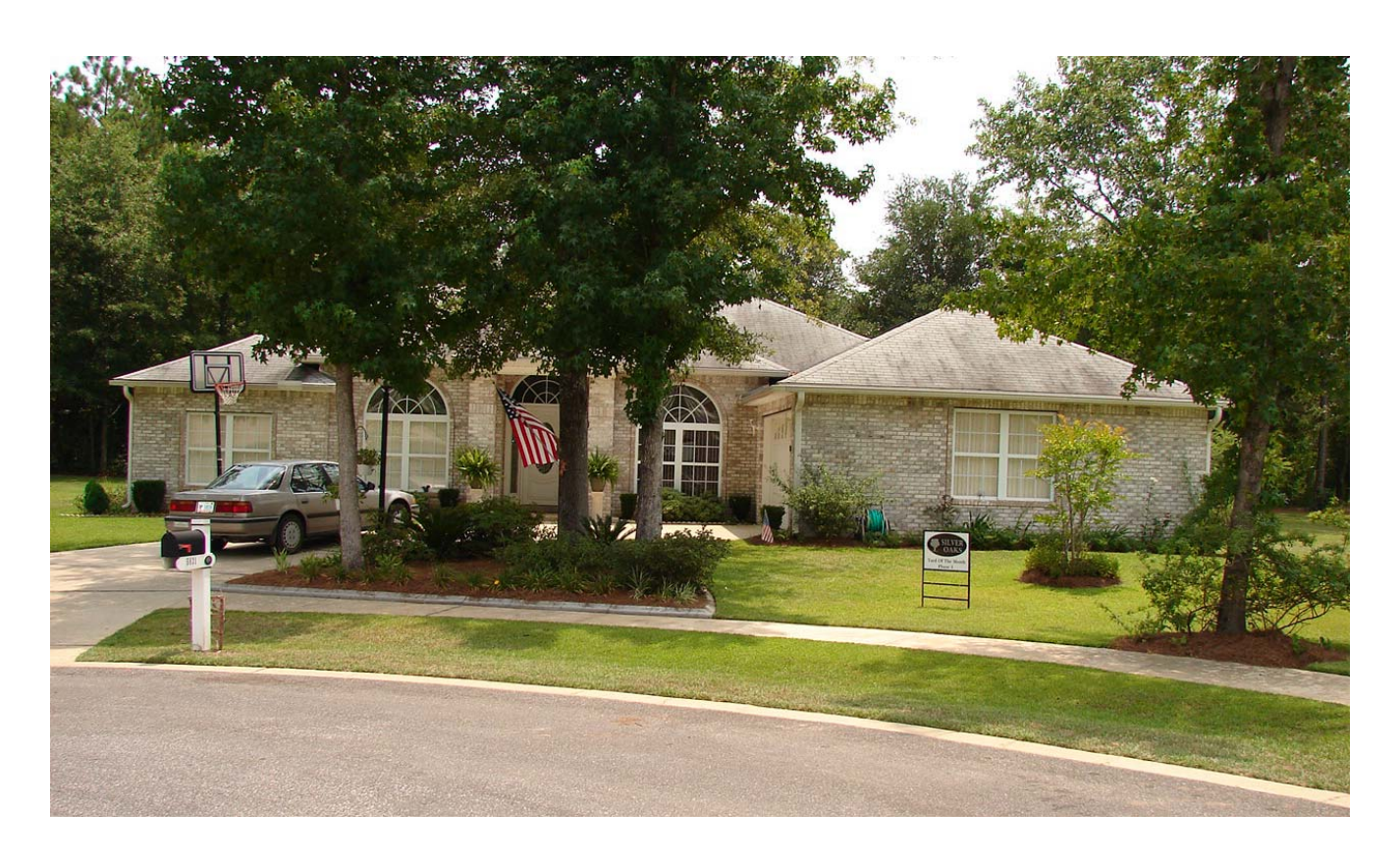
July 2006 Yard Of The Month (The Erb Home, 5831 Buckskin Court)