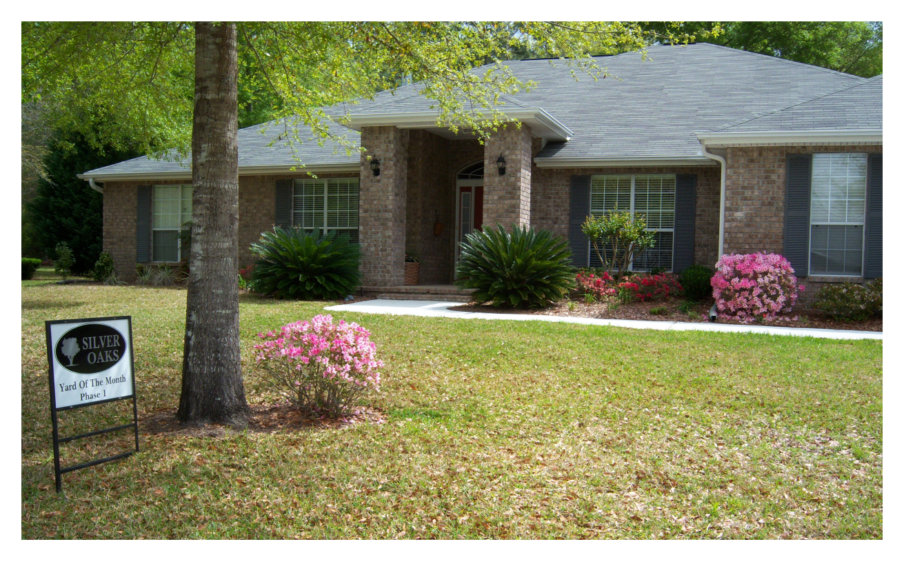
April 2008 Yard of The Month, The O'Neill's, 5845 Saratoga Drive