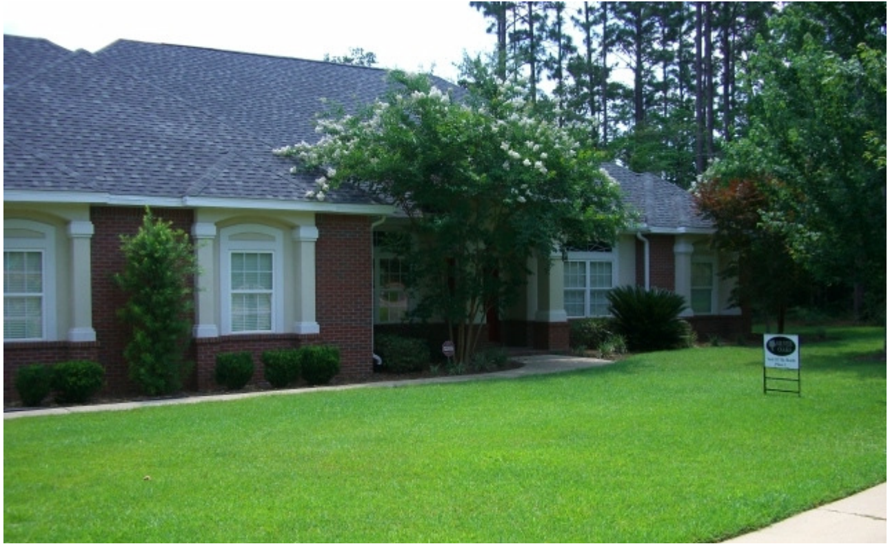
June 2008 Yard of The Month, The Wise Family, 5833 Hunting Meadows Drive