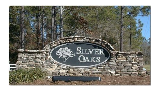
Silver Oaks Phase I Newsletter Editor P.O. Box 1542 Crestview FL 32536