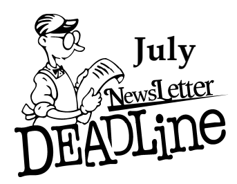
Friday, June 18th

This newsletter is published monthly. If you would like to submit an article or item for the newsletter please mail or e-mail it to the editor by the deadline date. We prefer to stay away from religious or political statements, but will announce social, church, or political events. Opinions expressed are those of the authors. Permission for Phase I residents to reprint any content is granted.