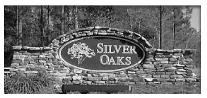
Silver Oaks Phase I Newsletter Editor P.O. Box 1542 Crestview, FL 32536