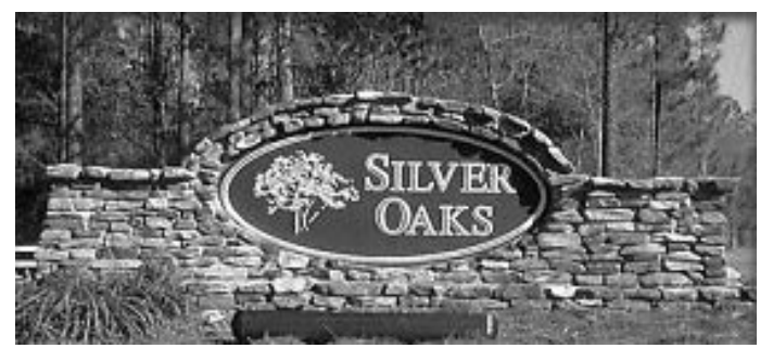
Silver Oaks Phase I Newsletter Editor P.O. Box 1542 Crestview, FL 32536