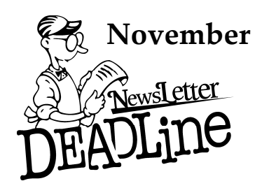
Friday, October 22<sup>nd</sup>

This newsletter is published monthly. If you would like to submit an article or item for the newsletter please mail or e-mail it to the editor by the deadline date. We prefer to stay away from religious or political statements, but will announce social, church, or political events. Opinions expressed are those of the authors. Permission for Phase I residents to reprint any content is granted.